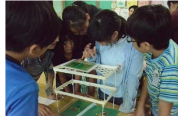
Figure 3: Students creating stop motion animation.

Through this activity, students learned to collaborate with each other. This time, we mixed girls and boys in one group. At first, many groups had some arguments between girl students and boy students since they rarely have a chance to work together. But with help from facilitators, they eventually started communicating and were able to work as a team. [Figure 3]