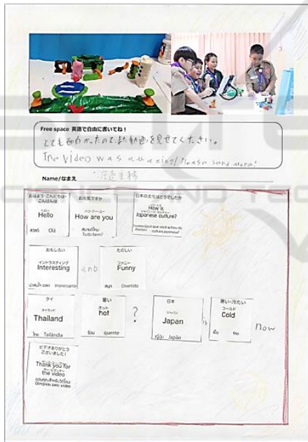
Figure 2: Student’s letter.

Children were able to think back about their culture and demonstrate those cultural stories to foreigner from their point of view.